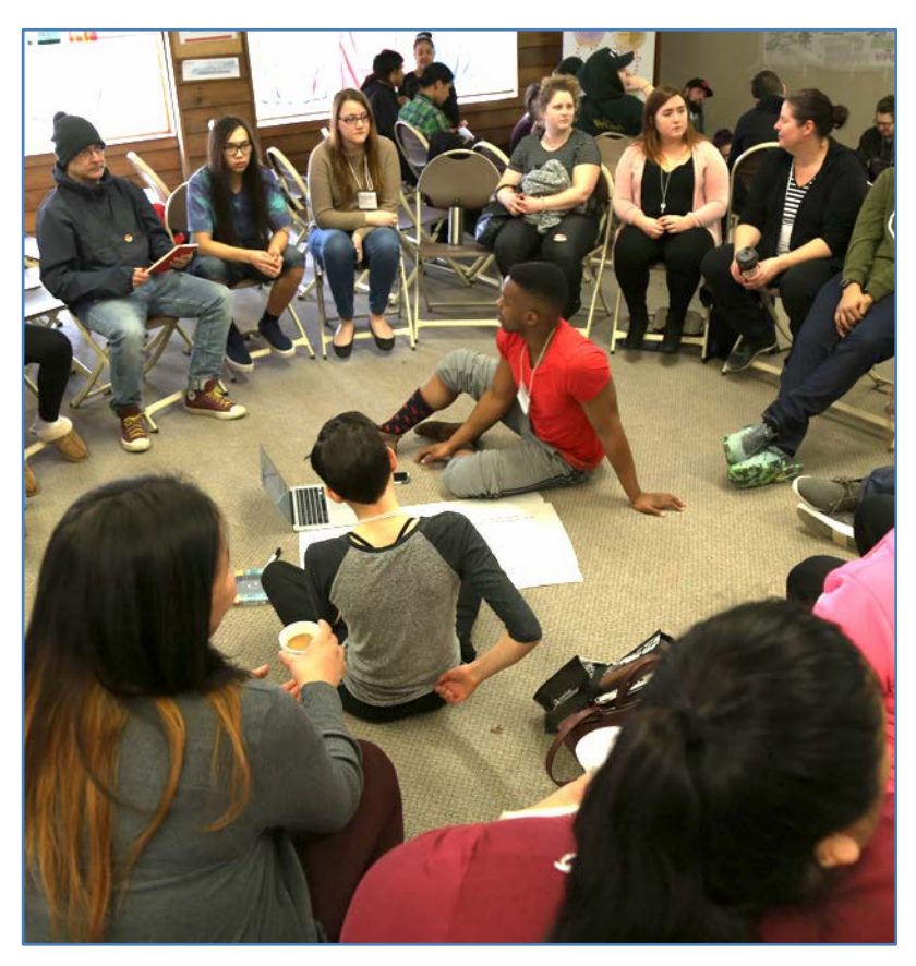
Policy discussions at Canada We Want Conference March 2, 2018

This report reflects the voices of 150 young people from coast to coast to coast who gathered to share their input into A Youth Policy for Canada. We understand Canada's commitment to develop this youth policy as a commitment to support our voices in shaping the country we want to live in. Working towards the #CanadaWeWant is therefore inherently connected to this Youth Policy: it is the way we will know the Government continually hears and values our stories in decision-making.